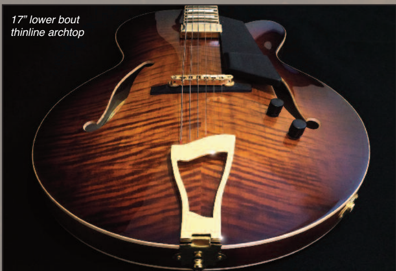
17" lower bout thinline archtop