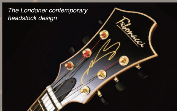
The Londoner contemporary headstock design