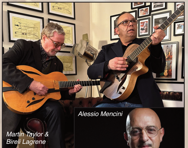
Martin Taylor & Bireli Lagrene