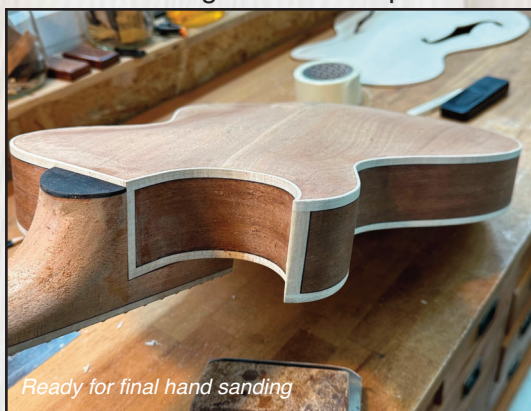
Ready for final hand sanding

We post regular updates on social media but were asked recently to share updates on our NEWS BLOG page on our website for anyone who does not use Facebook, Instagram. So here are a couple of pictures of a lovely Martin Taylor Lola that we have been working on with one piece carved mahogany back and sides, one piece mahogany neck, and carved Carpathian spruce top ready for final sanding. More information on the Martin Taylor Lola here: https://www.fibonacciguitars.com/martin-taylor-lola Please subscribe to our NEWS BLOG on our website for regular updates on everything at Fibonacci Guitars.