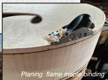
Planing flame maple binding