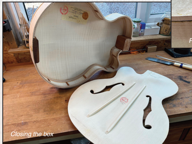
Closing the box

Building a carved archtop guitar is incredibly labor intensive. Completing the body build is a major milestone met and a pivotal point in its construction. So we thought we would share a couple of pictures of this lovely custom Ambassador with flawless Carpathian carved spruce and flame maple. So while you are enjoying the pictures, we will get on with the neck. More information on our Ambassador model here: https://www.fibonacciguitars.com/ambassador More information on all of our guitars here: https://www.fibonacciguitars.com https://www.facebook.com/FibonacciGuitars