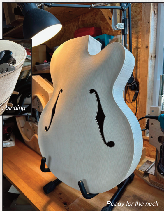
Ready for the neck