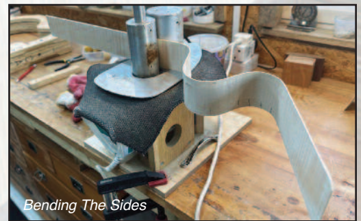
Bending The Sides

Then comes the tricky part, steaming the 2mm sides just enough to bend into shape without cracking. Because of the short grain, highly figured flame maple is especially tricky. We also bind all of our guitars with wood binding which follows a similar method.