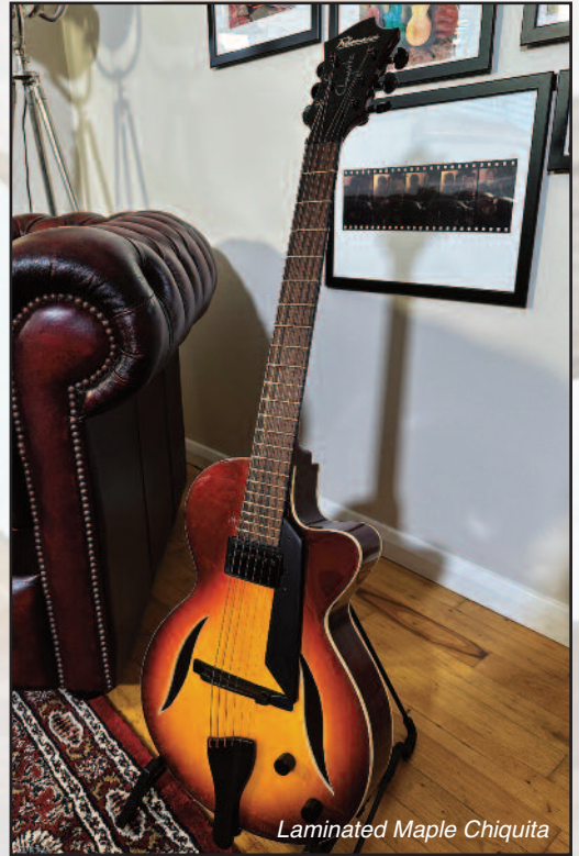
Laminated Maple Chiquita

This contemporary archtop guitar is 13" x 76 mm. Produced with laminated maple top, back and sides, internal soundpost, one piece flame mape neck, rosewood fingerboard, finger-rest, floating bridge & tailpiece are all in Indian ebony. Hand wired in shielded, steel braided cable, Switchcraft output jack, CTS pots, and fitted with a black set-in Kent Armstrong '57 humbucker, and black Grover tuners. A bright sounding archtop producing crisp tones and finished in sunburst nitrocellulose lacquer.