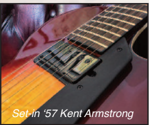
Set-in '57 Kent Armstrong