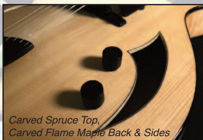
Carved Spruce Top, Carved Flame Maple Back & Sides