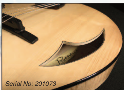
Serial No: 201073