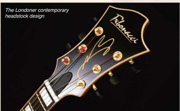
The Londoner contemporary headstock design

Body Width at Lower Bout: 425mm - Body Depth: 56mm - Top Wood: Hand Carved Flame Maple - Back & Sides: Maple - Neck Profile: 44.5mm at Nut - Finger Board: Ebony - Neck Scaling: 637mm - Frets: 22 - Bridge: Ebony Floating AVR111 - Pickup: Floating 'Big Ben' Humbucker by Jon Dickinson