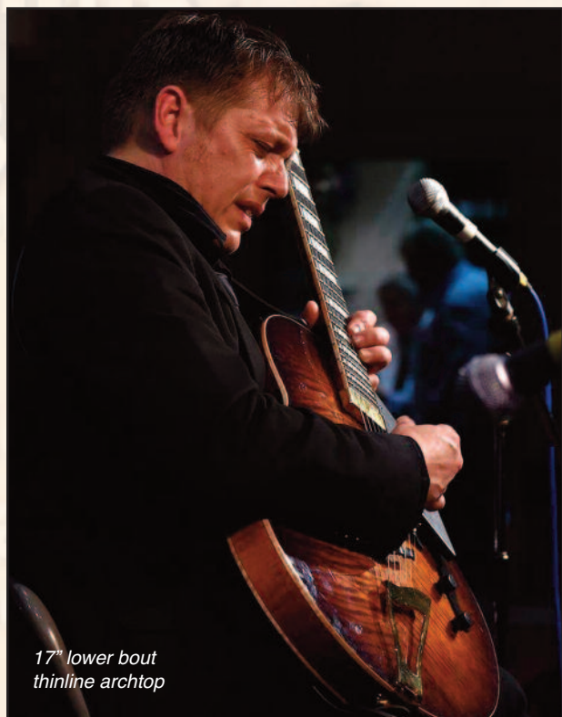
17" lower bout thinline archtop

The Nigel Price Londoner is available to order now. Full specifications and audio files can be found at: https://www.fibonacciguitars.com/nigel-price-londoner Read the full Jazzwise review on page 56, February 2020 issue: https://www.jazzwise.com/