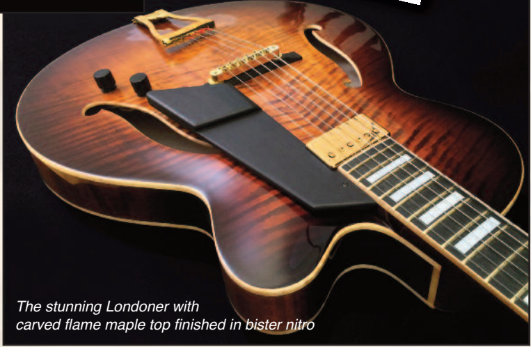
The stunning Londoner with carved flame maple top finished in bister nitro

on an archtop. Fitted to the Londoner and being big on sound, we aptly named it the 'Big Ben'!