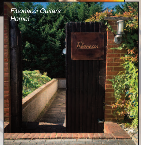
Fibonacci Guitars Home!

More information, https://www.fibonacciguitars.com https://www.facebook.com/FibonacciGuitars https://www.facebook.com/boutique.guitar