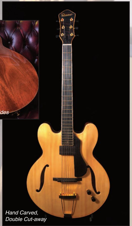
Hand Carved, Double Cut-away