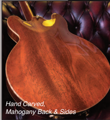
Hand Carved, Mahogany Back & Sides

Just in case you hadn't noticed, the Fibonacci Fibonacci, has an obvious influence in aesthetic design from a very well known guitar builder (answers on a postcard!). But when you pick it up and play it, and you will realise immediately, that this is a very different guitar altogether. It feels light but well built, with all the hallmarks to let you know you are hold a high quality instrument.