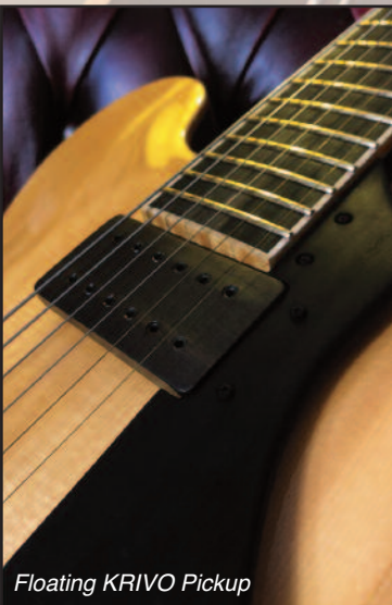
Floating KRIVO Pickup

The Fibonacci Fibonacci is a completely hollow, double cut-away archtop, with 16" lower bout, 56mm deep body, produced from a hand carved AAA spruce top, with hand carved mahogany back and sides, and neck, 22 Jescar EVO Gold frets, 17th fret neck joint. It is complimented with solid maple binding, ebony fingerboard and floating pickguard. We have opted to fit the Fibonacci Fibonacci with a gold, floating trapeze type tailpiece as standard, but a floating ebony one can be fitted if preferred.